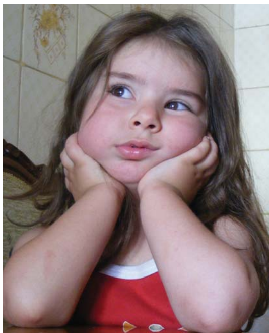
Wherefore be ye not unwise, but understanding what the will of the Lord is. Ephesians 5:17

Registration is Monday evening, August 22 at 6:00 in the cafeteria with classes beginning on Thursday evening, August 25 at 6:30. I pray I will see many of you there.